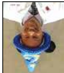
The "Stain Wizard"

Saturday, October 7, 2017 Katzson Brothers 960 Vallejo St. Denver, CO 80204 303-893-3535 9:00 AM – 12:00 PM