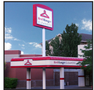
The "Stain Wizard"

September 22, 2018 9:00 a.m. to 12:00 p.m. Light Snacks and Beverages