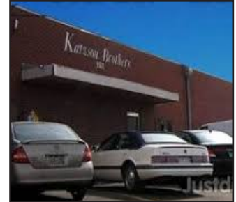
The "Stain Wizard"

Saturday, September 29, 2018 9:00 a.m. to 12:00 p.m. Light Snacks and Beverages