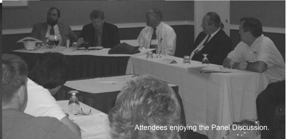
Attendees enjoying the Panel Discussion.